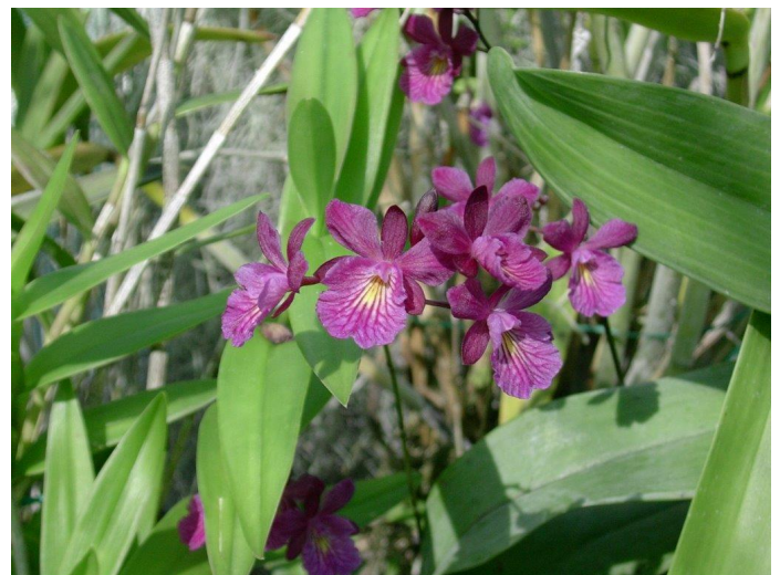
Tetratonia Dark Prince. W.W. Goodale Moir 1965